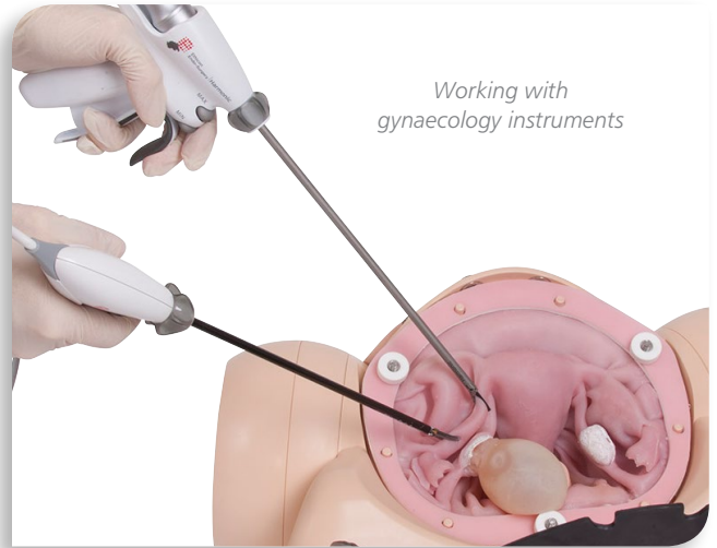
Working with gynaecology instruments