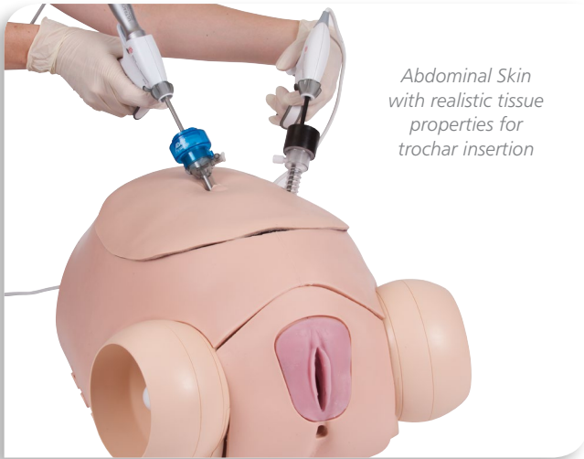
Abdominal Skin with realistic tissue properties for trochar insertion